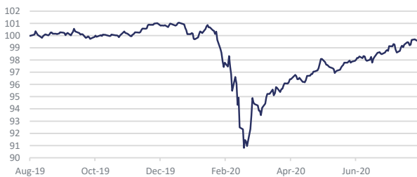
UBS Multi Strategy I4C-E (DBMSI4C LX EQUITY)