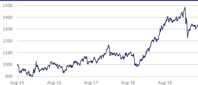
Quantica Managed Futures I3C-U (DPQI3CU LX)