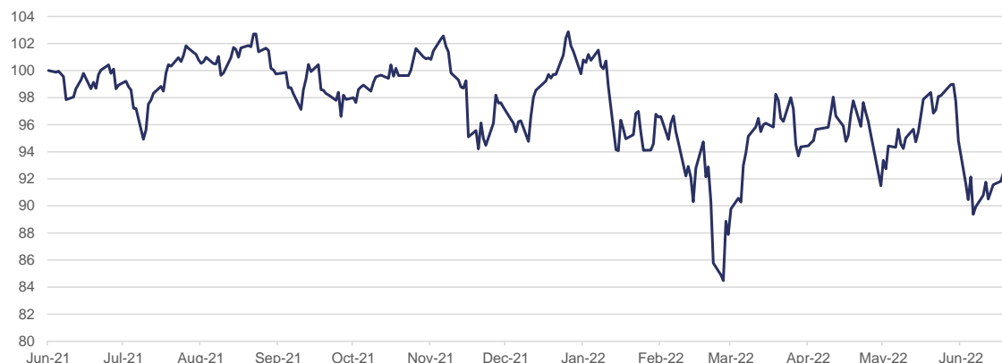
Alma Perdurance European Equity Fund (I EUR C share class)