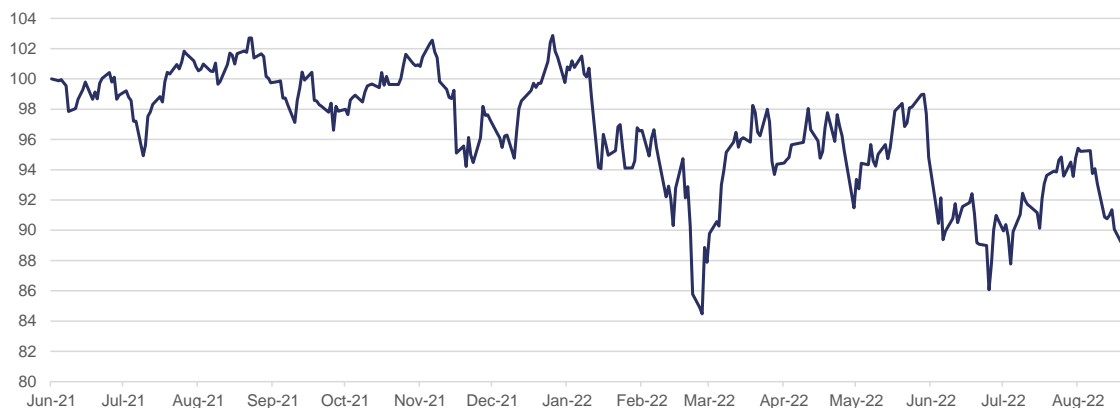
Alma Perdurance European Equity Fund (I EUR C share class)