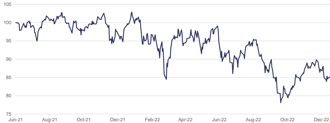
Alma Perdurance European Equity Fund (I EUR C share class)