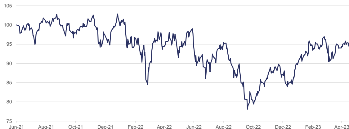
Alma Perdurance European Equity Fund (I EUR C share class)