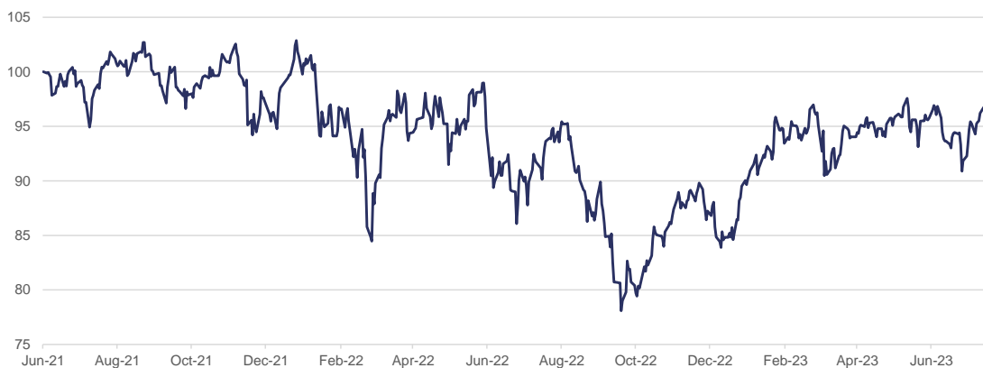
Alma Perdurance European Equity Fund (I EUR C share class)