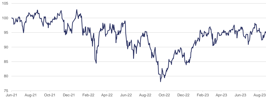
Alma Perdurance European Equity Fund (I EUR C share class)