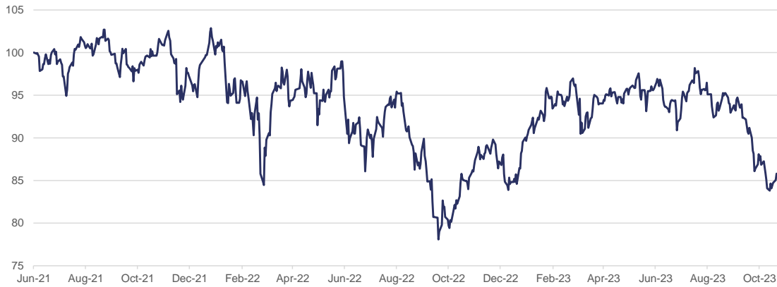
Alma Perdurance European Equity Fund (I EUR C share class)