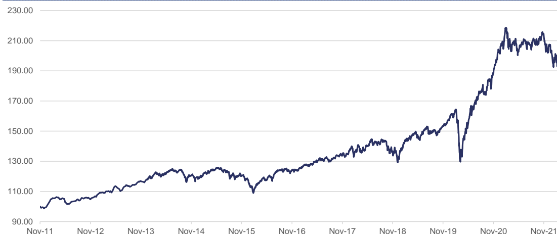
Alma US Convertible Fund (I USD C share class)