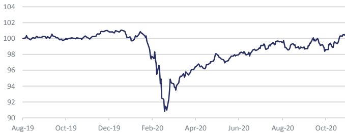
UBS Multi Strategy I4C-E (DBMSI4C LX EQUITY)