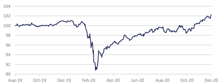
UBS Multi Strategy I4C-E (DBMSI4C LX EQUITY)