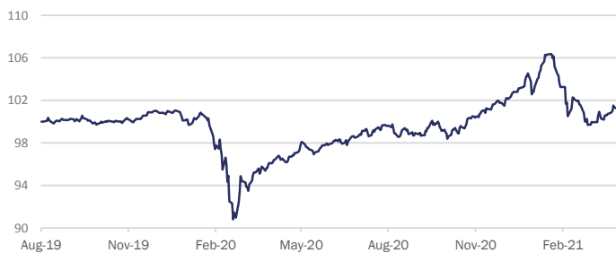
UBS Multi Strategy I4C-E (DBMSI4C LX EQUITY)