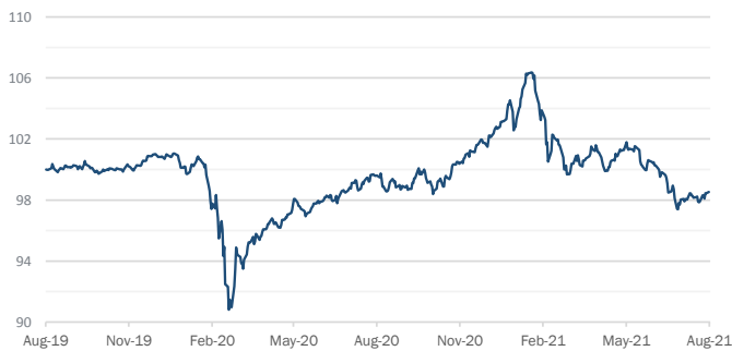
UBS Multi Strategy I4C-E (DBMSI4C LX EQUITY)