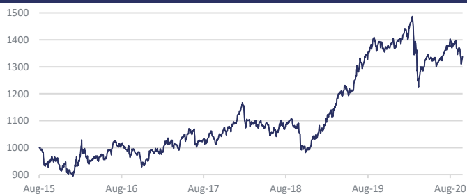
Quantica Managed Futures I3C-U (DPQI3CU LX)