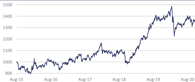
Quantica Managed Futures I3C-U (DPQI3CU LX)