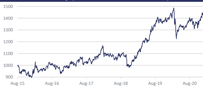
Quantica Managed Futures I3C-U (DPQI3CU LX)