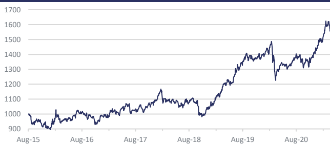
Quantica Managed Futures I3C-U (DPQI3CU LX)