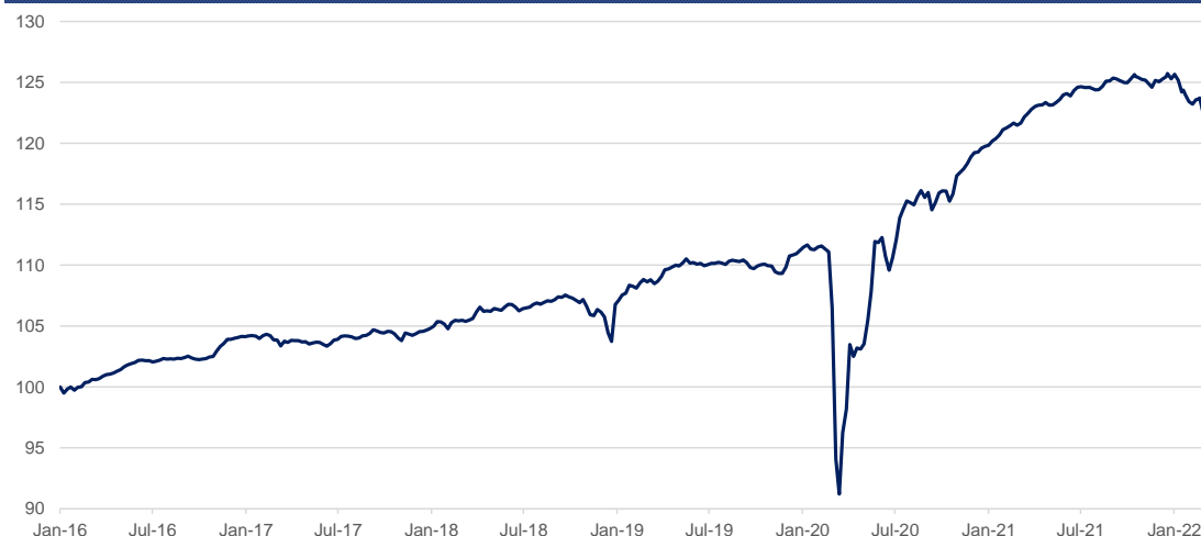
Alma Platinum IV MidOcean Absolute Return Credit (11C-U Share Class)