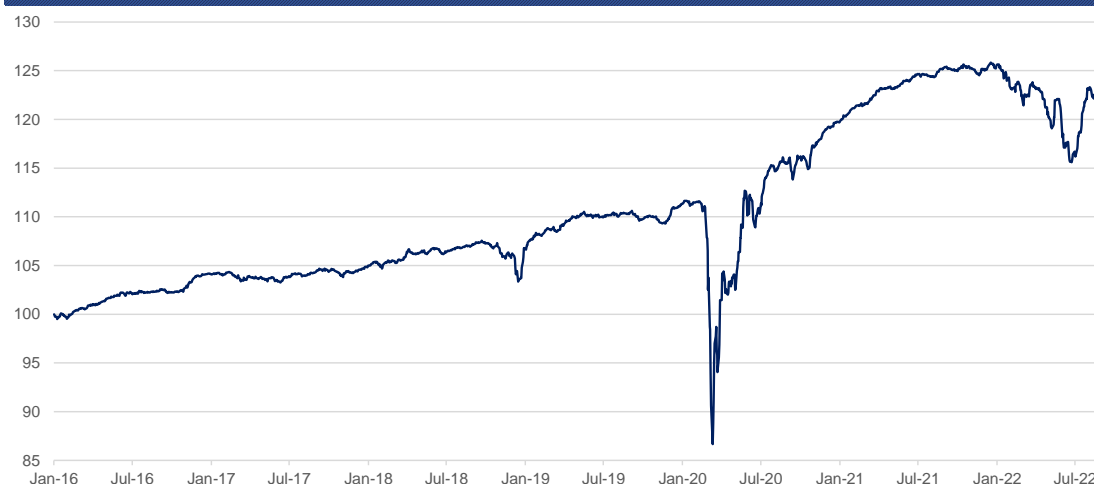
Alma Platinum IV MidOcean Absolute Return Credit (I1C-U Share Class)