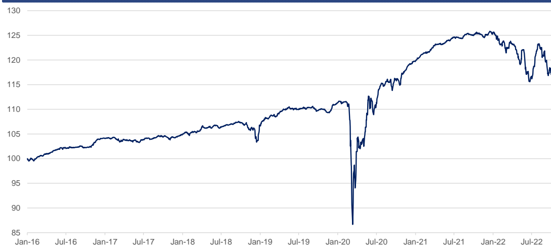
Alma Platinum IV MidOcean Absolute Return Credit (I1C-U Share Class)