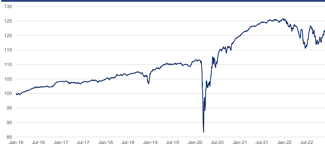
Alma Platinum IV MidOcean Absolute Return Credit (I1C-U Share Class)