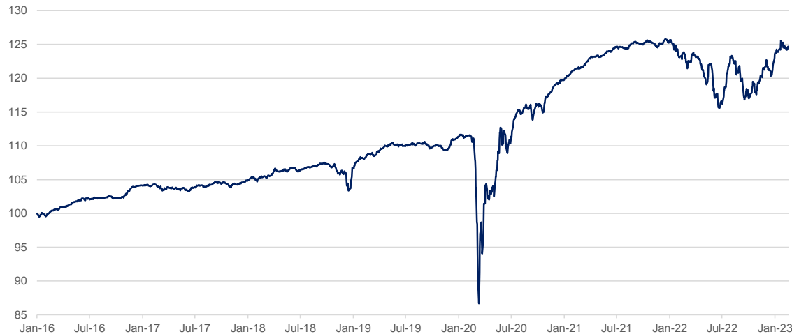
Alma Platinum IV MidOcean Absolute Return Credit (I1C-U Share Class)