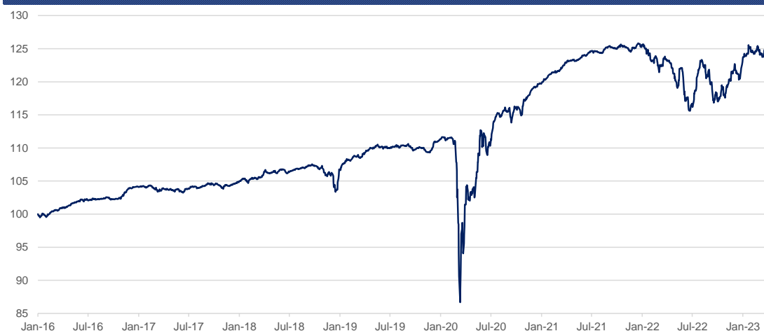
Alma Platinum IV MidOcean Absolute Return Credit (I1C-U Share Class)