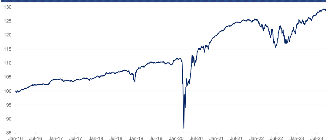
Alma Platinum IV MidOcean Absolute Return Credit (I1C-U Share Class)