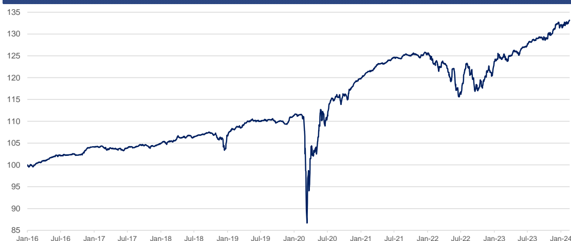
Alma Platinum IV MidOcean Absolute Return Credit (I1C-U Share Class)