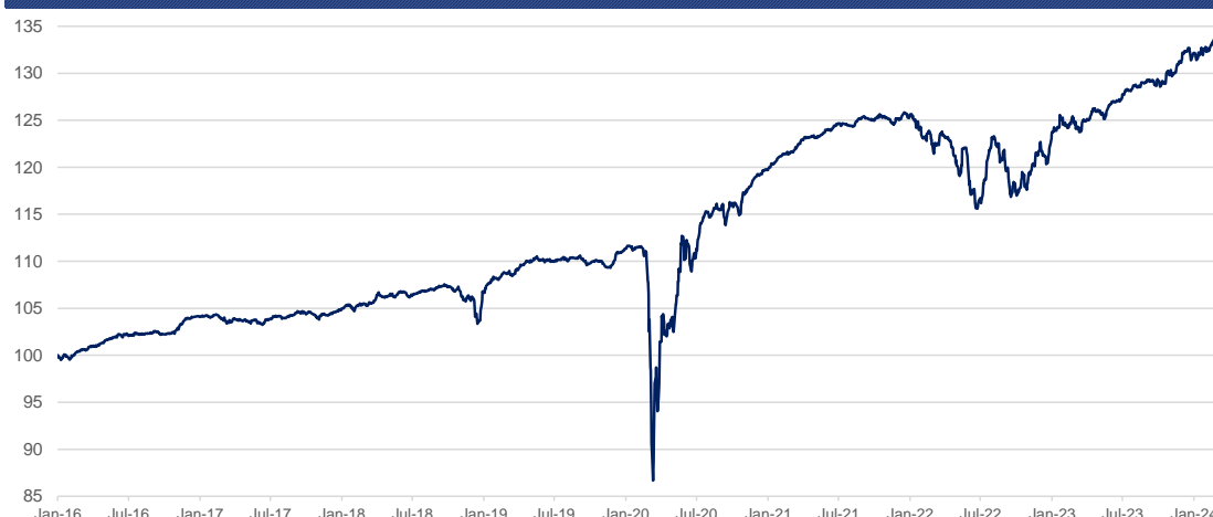
Alma Platinum IV MidOcean Absolute Return Credit (11C-U Share Class)