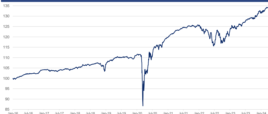
Alma Platinum IV MidOcean Absolute Return Credit (11C-U Share Class)