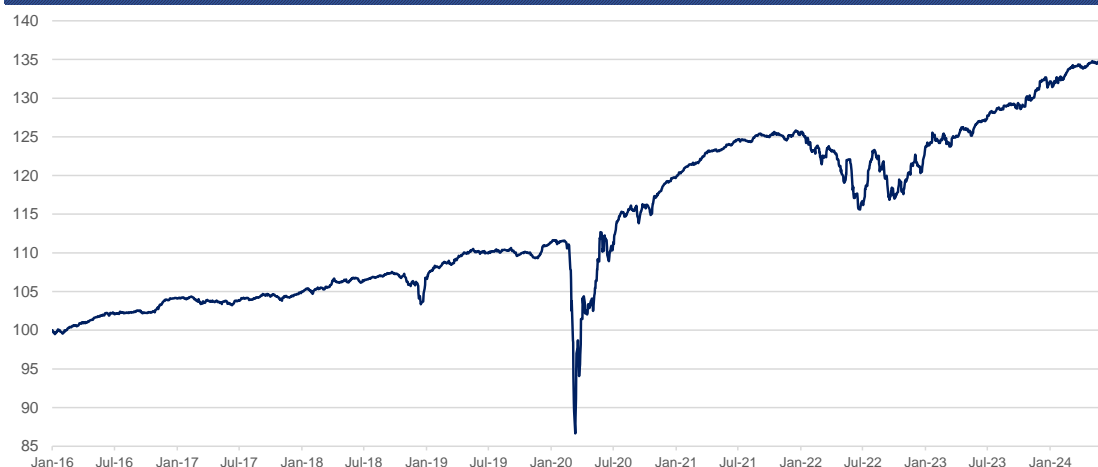
Alma Platinum IV MidOcean Absolute Return Credit (11C-U Share Class)