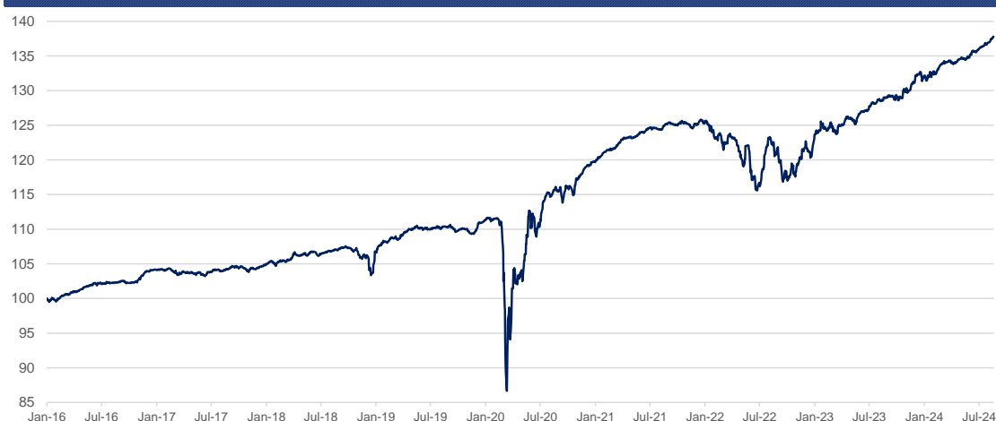
Alma MidOcean Absolute Return Credit (I1C-U Share Class)