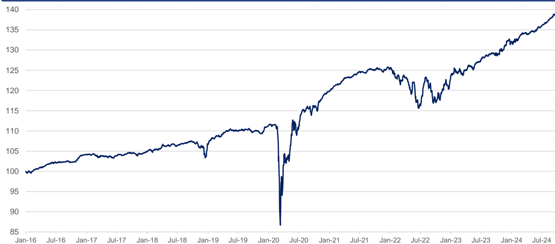
Alma MidOcean Absolute Return Credit (I1C-U Share Class)