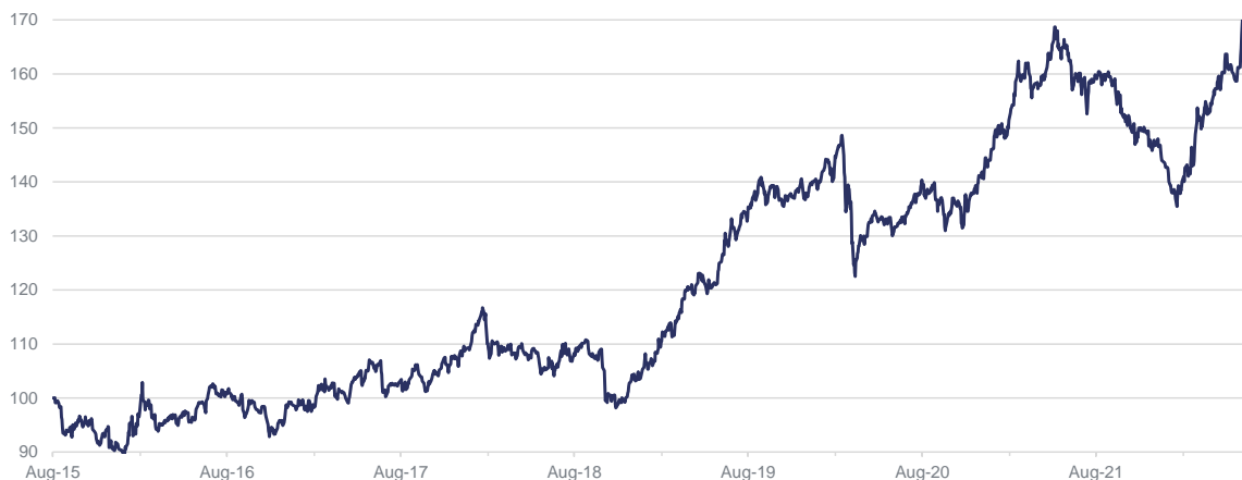
Quantica Managed Futures I3C-U (DPQI3CU LX)