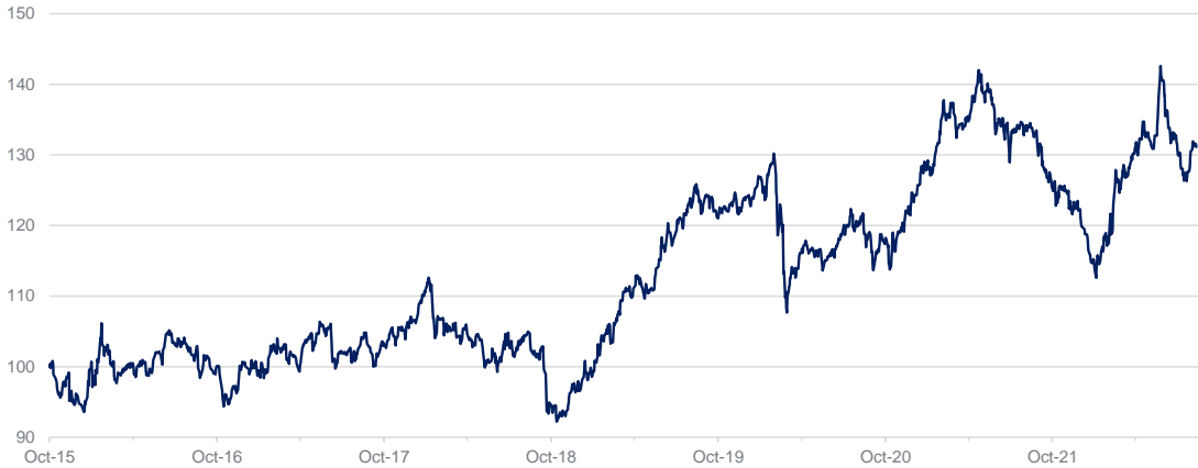
Quantica Managed Futures R1C-E (DPQR1CE LX)