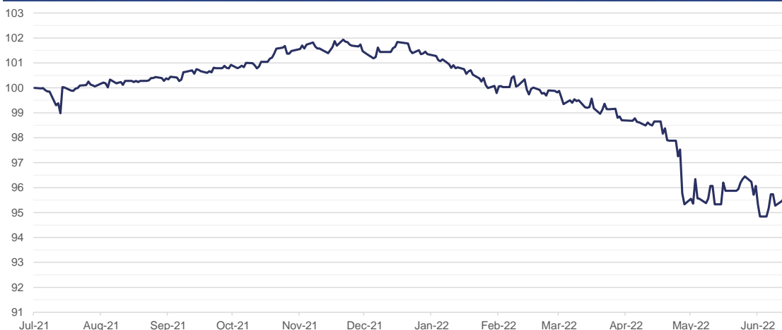
Alma Platinum IV DLD Convertible Arbitrage (I1C-U Share Class)