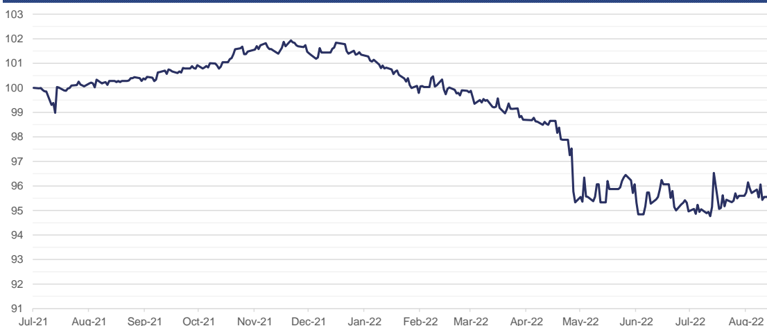
Alma Platinum IV DLD Convertible Arbitrage (I1C-U Share Class)