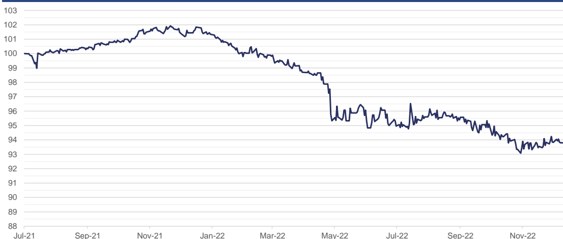
Alma Platinum IV DLD Convertible Arbitrage (I1C-U Share Class)