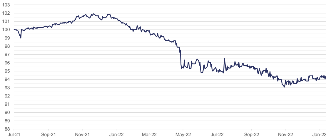
Alma Platinum IV DLD Convertible Arbitrage (I1C-U Share Class)