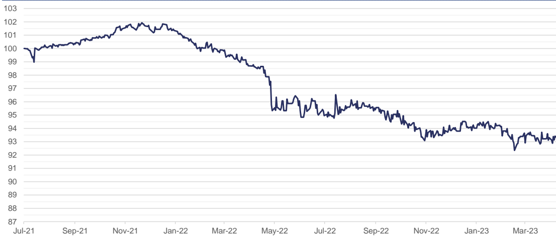
Alma Platinum IV DLD Convertible Arbitrage (I1C-U Share Class)